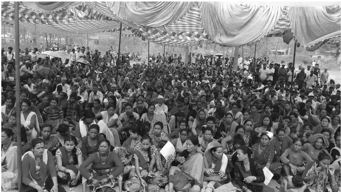
Mass rally against land encroachment by Trust (Guthi) in Dang, Nepal.

On this aspect, States should have the obligation to ensure that policies are in place to protect those susceptible to loss of land as a result of climate change. There should be available remedies, safe and appropriate relocation, including compensation, for those who lose their lands. Moreover, in anticipation of the worsening impacts of climate change, States should take into consideration sustainable land use and management in their policy formulation.