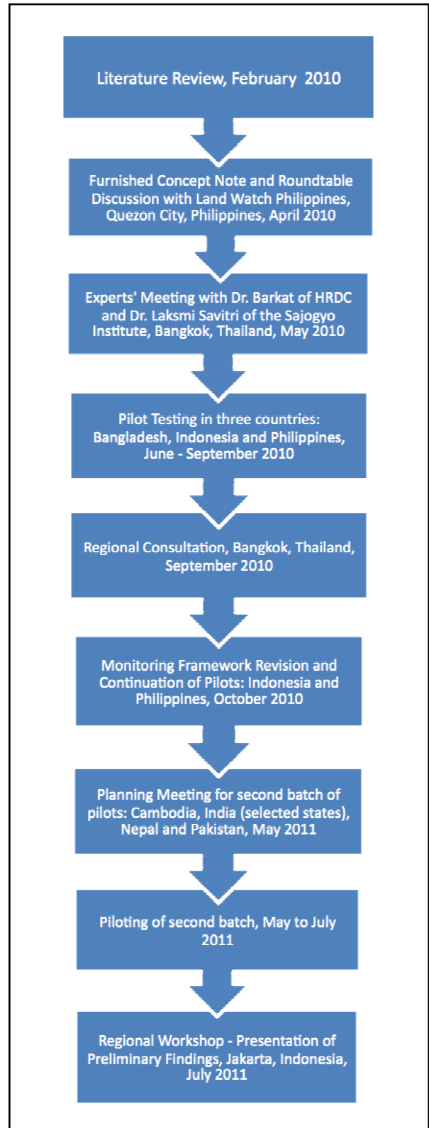
Fig. 1 Process in Crafting the LWA Land Reform Monitoring Framework

This land reform monitoring framework will articulate the assumptions, indicators, methodology, and mechanisms for CSOs to engage constructively governments and examine other countries' experiences as part